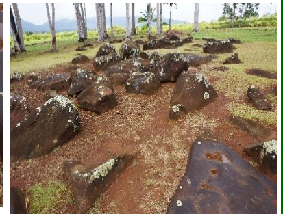
ho’okupu nā lei lau kī